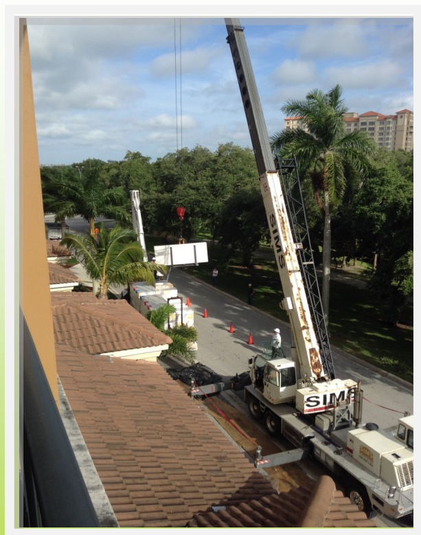
Photo of new drywall for 6th floor.

We appreciate all your patience and cooperation during this project.